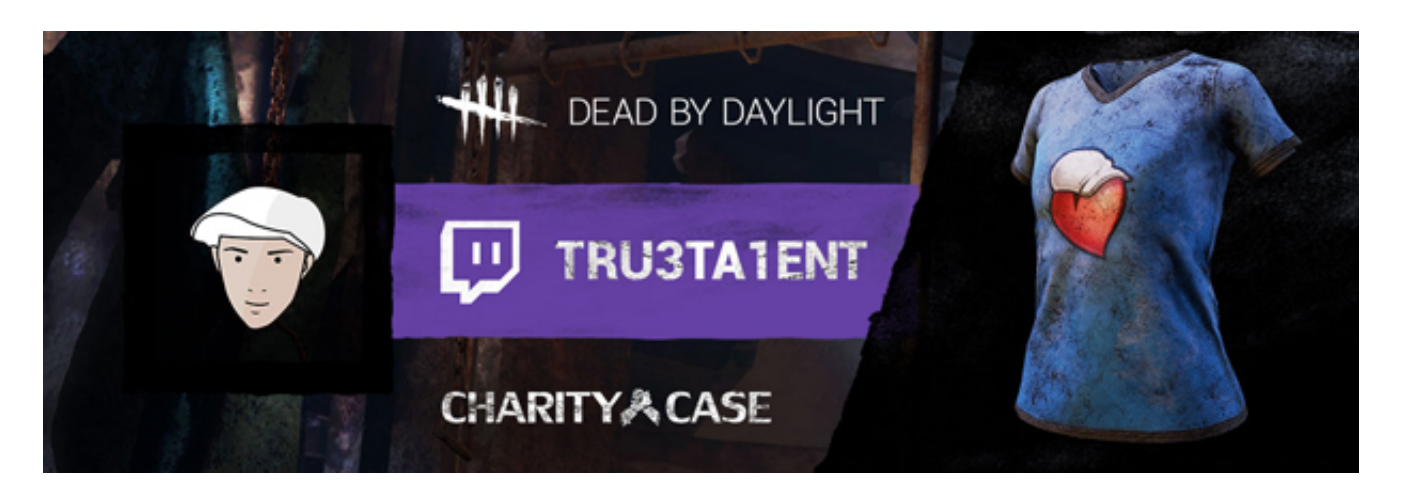
Mofugga U graduate: A unique top for Dwight, inspired by Vinc3ntVega